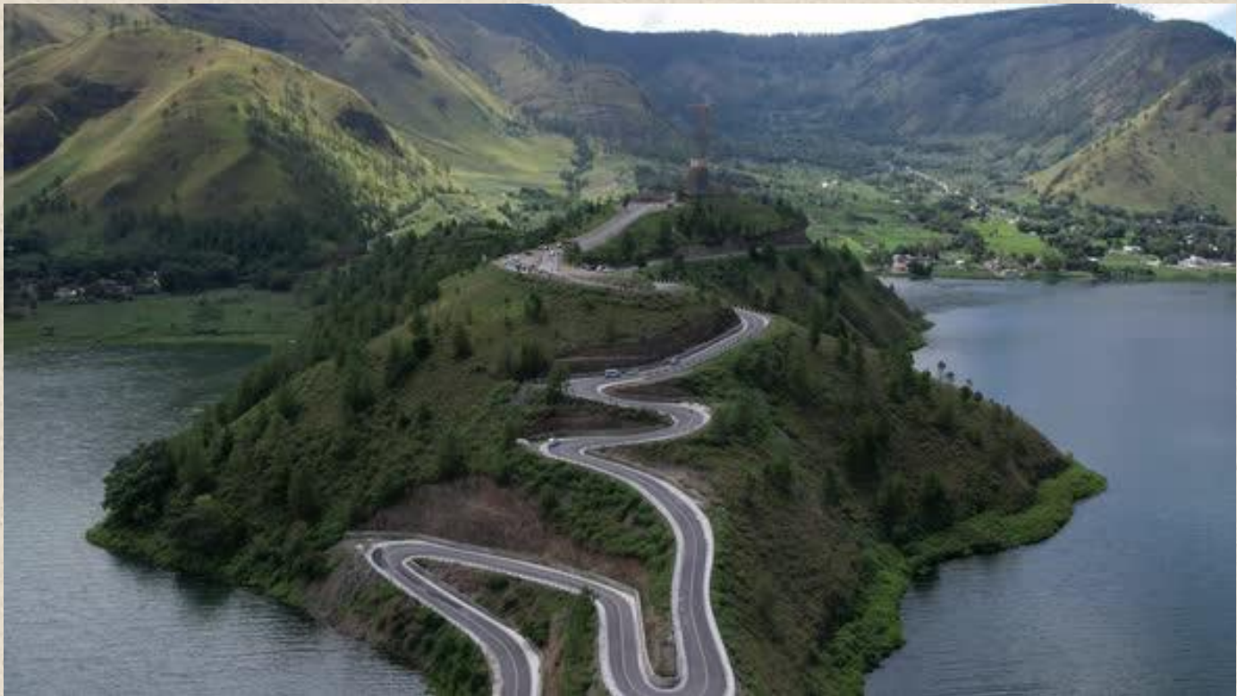
Sibea Bea Hill