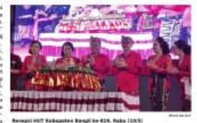
Resepsi HUT Kabupaten Bangli ke-819, dengan Bupati Irena Adis sebagai tamu kehormatan.

BANGLI, Media Bali- Bupati Kabupaten Bangli, Irena Adis, meriahkan perayaan HUT Kabupaten Bangli ke-819, dengan menggelar resepsi di Gedung Sate Kabupaten Bangli.