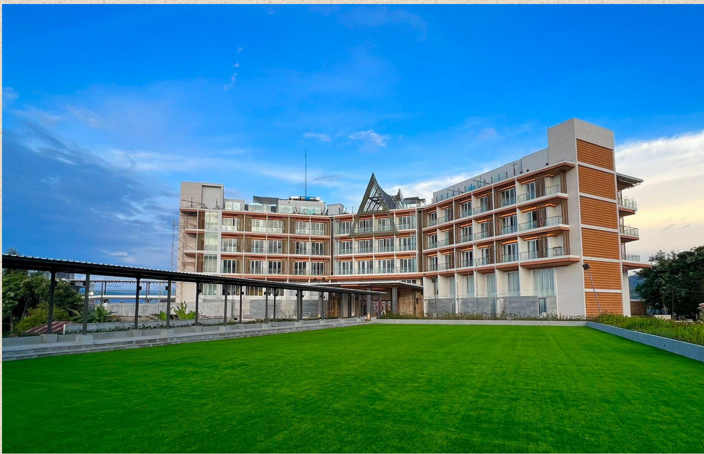
Marianna Resort and Convention Lake Toba, Samosir Island