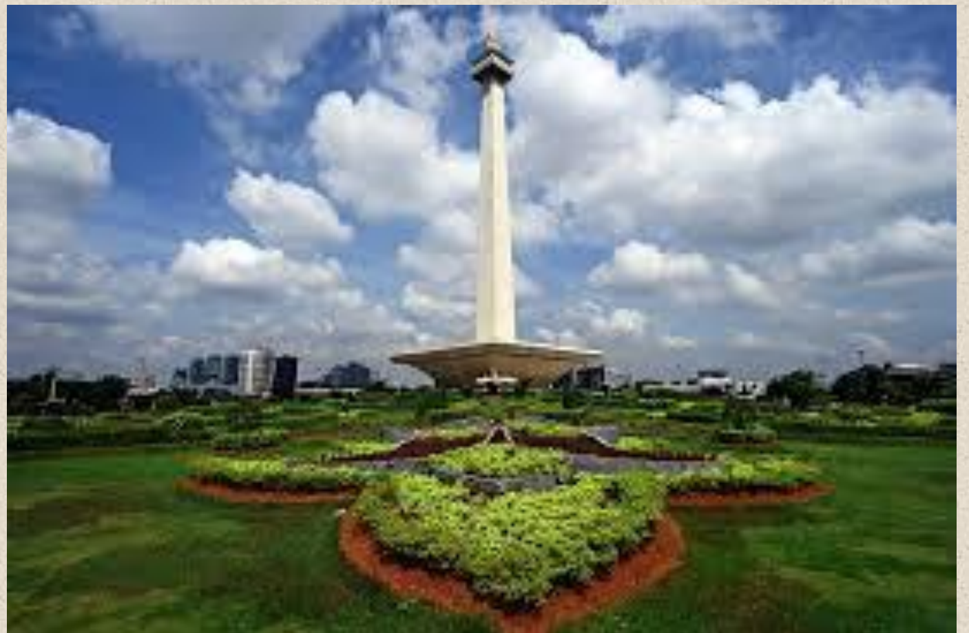
Monas – National Monument, Jakarta