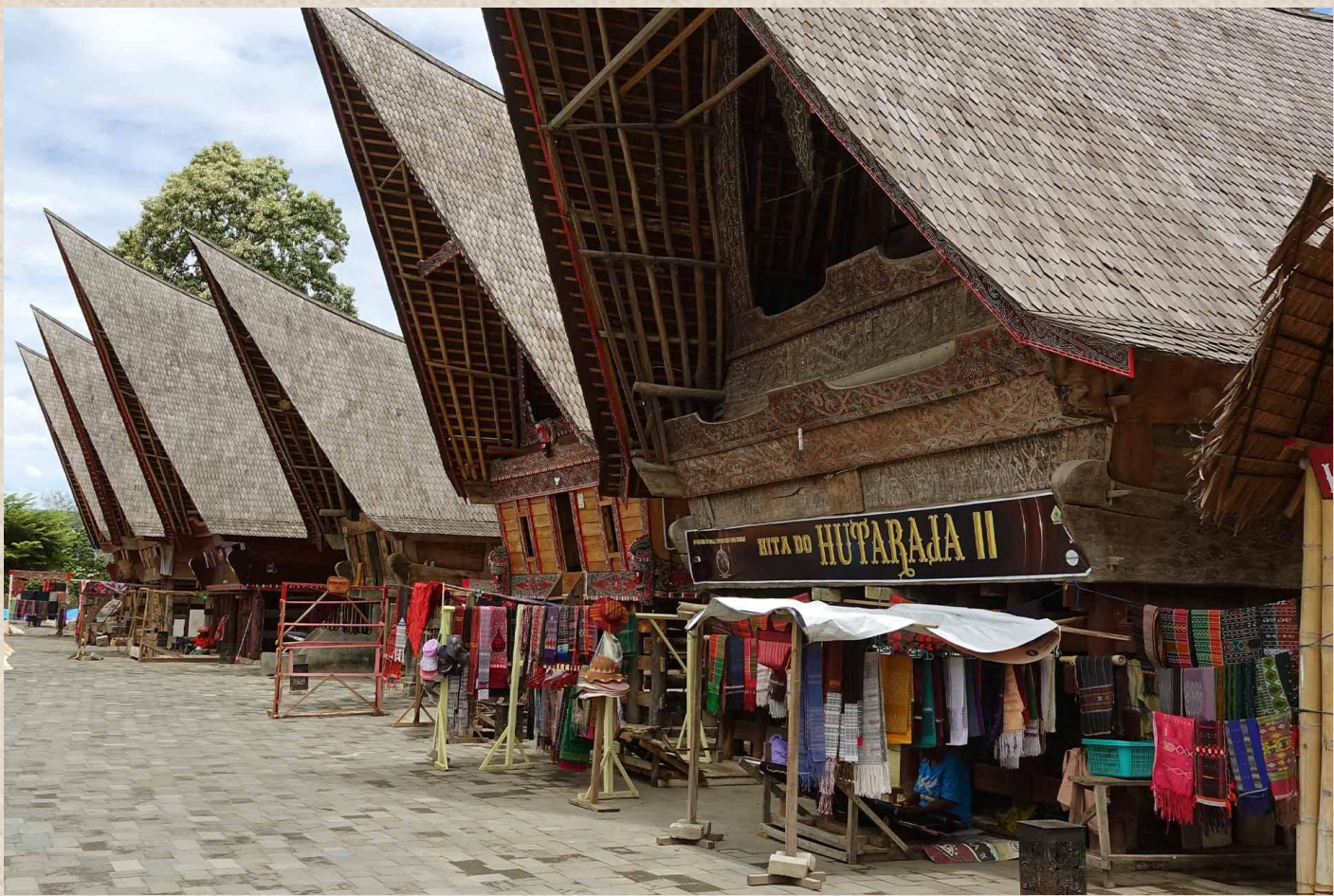
Kampung Ulos – Traditional Shopping